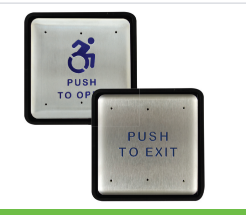
Stainless Steel Wallplate Push Buttons for Manual Activation