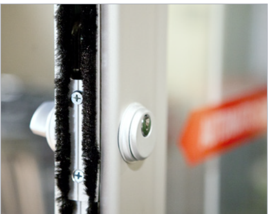
Exterior Key Lock & Interior Thumb Lock