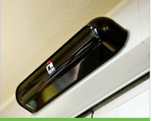
Header Mounted Motion Sensor on Interior and Exterior for 2-Way Traffic